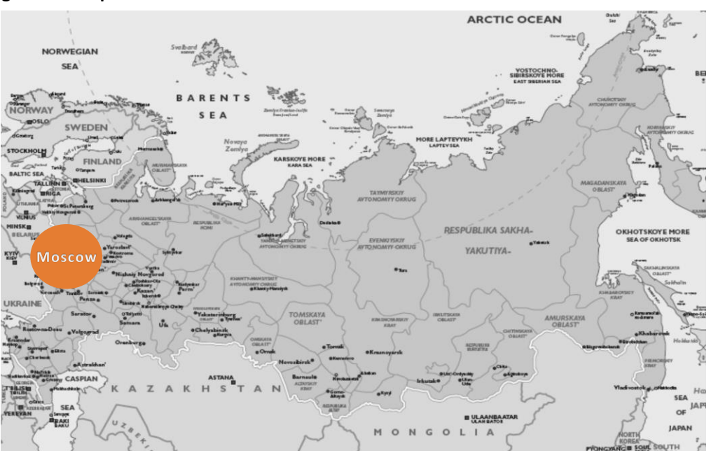
Figure 2.1: Map of the Russian Federation

The number of hotels and office projects has increased in accordance with the increase in demand due to projects, which have been suspended due to the economic crisis in the sector have been re-launched since the end of 2009. In 2013, the investments made reached 8.3 billion US Dollars. Further, 3.8% increase in investments, equaling to 12.3 billion US Dollars is anticipated for the year 2024. Moreover, Russia to host the FIFA 2018 World Cup indicates that the investments to this region will increase within the coming years. Moscow, in which the Company has developed projects, is one of the cities that will host the World Cup games. The Russian map showing Moscow can be found below.