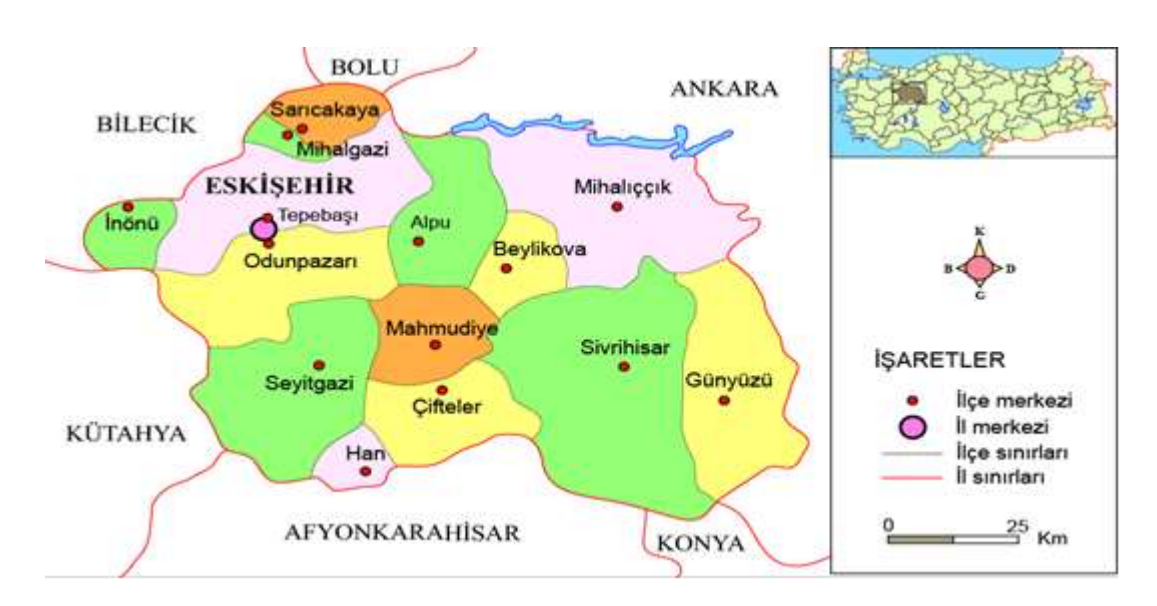
Location of Eskişehir

In terms of socio-economic development it is one of Turkey's leading cities, with 783 organizations operating in the area of 32 million m² has one of Turkey's largest Organized Industrial Zones. In addition to large state enterprises in the province, there are many private organizations that have been realized with local capital investments which gained momentum after 1960. Major industries are food, textile, locomotive, machinery manufacturing, brick, tile and cement. Almost all industrial enterprises gathered in the city center. In 2007, the province with the exports of 472 million 118 thousand dollars in the country took the 19th place. Approximately 7 million dollars of exports in 2007 were made in agriculture, 450 million dollars in industry and 15 million dollars in mining sectors.