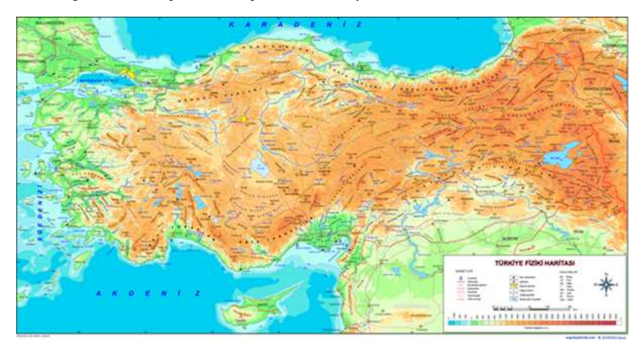
Map of the Republic of Turkey

Turkey but also the Turkish Council, Turkish Culture and Arts Joint Administration, as a member of organizations such as the Organization of Islamic Cooperation and Economic Cooperation with the Middle East, with the Turkish state in Central Asia and African countries with close cultural, political, has developed economic and industrial relations. Its location on the migration path between Europe and Asia gives a sense of power and importance to Turkey.